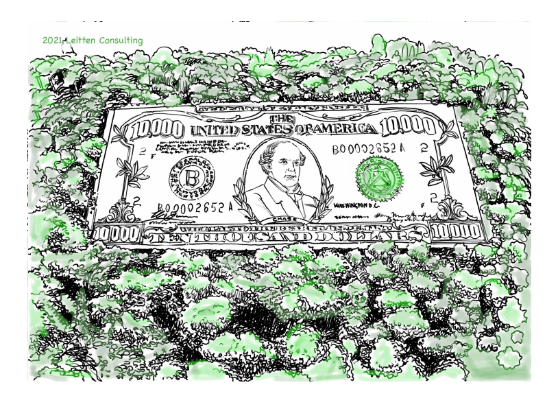
The forest of financial savings

Throughout the decade, CMS failed to recognize the potential for DME to reduce treatment spending or to develop a plan to invest in needed DME, where a forest of financial savings stood waiting for harvest. That forest remains verdant today, having grown at a rate that dramatically outpaced inflation over the decade.